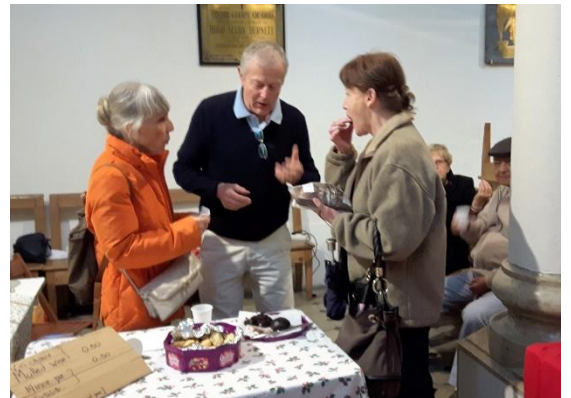
Always popular was Gaston's mulled wine and mince pies.